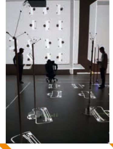
2. Test the ideas and drafts with all participants